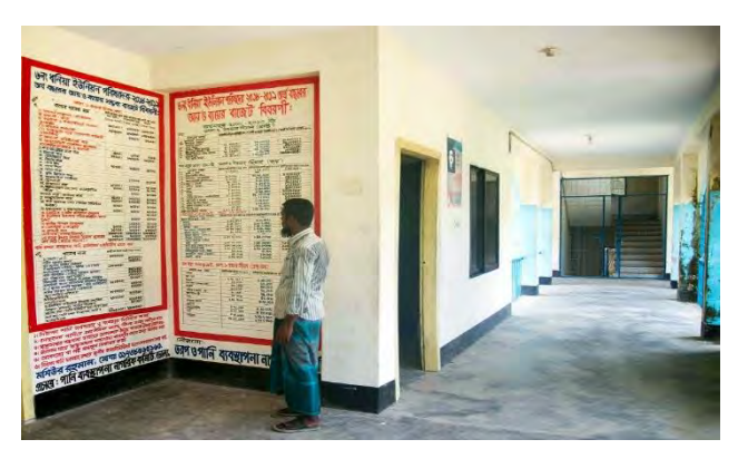
Wall painting: to ensure transparency and access to information, the budget is painted on the wall of buildings in 9 Union Parishads, through a process that is facilitated by CSOs.