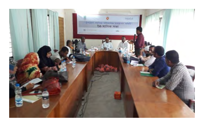
CSOs members of the IWRM and WASH committees at Union and Upazila Parishad: CSOs can share the needs of marginalised people and monitor the implementation of the commitments taken towards them

In Bhola, various activities have been introduced to establish accountability mechanisms, as presented here: